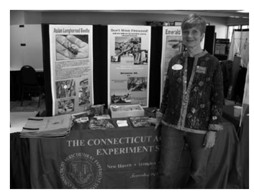
Display by CT Agriculture Experiment Station.

non-profit groups provided a rich array of displays to further inform visitors of current issues relevant to their work and volunteer efforts. The CACIWC Board of Directors has begun a detailed review of the evaluations forms submitted by participants of