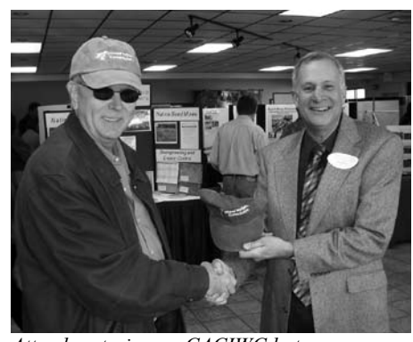
Attendees trying on CACIWC hats.

this conference. In addition to informing us of their opinions of the educational sessions, the participants also provided valuable suggestions for workshop topics for next