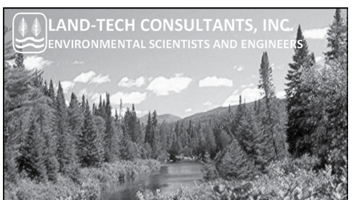
PROVIDING QUALITY ENGINEERING AND ENVIRONMENTAL CONSULTING SERVICES TO MUNICIPALITIES FOR 30 YEARS

Westbrook's green infrastructure, including the tidal shoreline of beaches, islands and salt marshes, the uplands of forests, wetlands, rocky ridges and agricultural fields, and the rivers and streams that link continued, page 12