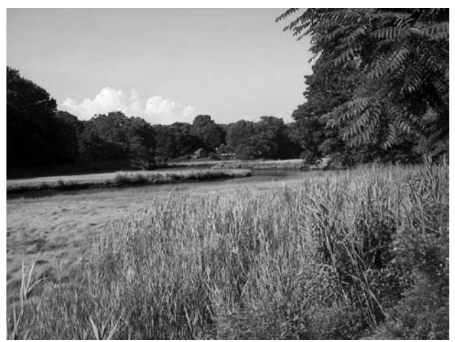
Tidal Marsh and Woodlands; Green Infrastructure along Patchogue River.

these natural resources, provides strong historical and present influence on our environment, public health, sense of character, community physical structure and quality of life.